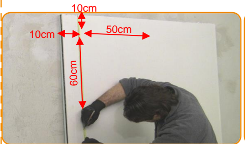
On each Rewall panel mark the holes points placed as per the drawing here shown