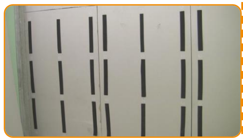
Apply the adhesive Syl strip between two nails