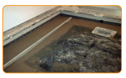
Build the screed