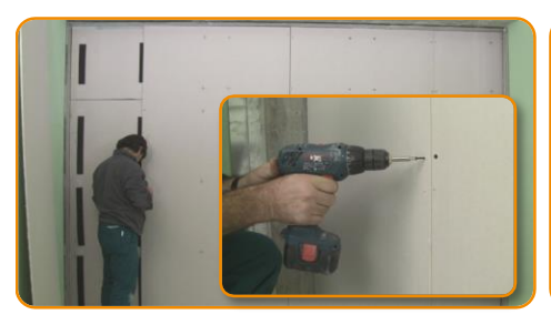
Fix the second gypsum board by gluing dots Apply the plastic mesh tape in the gypsum or screwing it on centre line and on the side borders with double thread screw. Offset