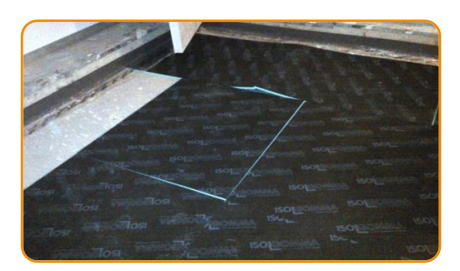
Install the edging strip to the walls and install the panels on the floor with the rubber side to the top