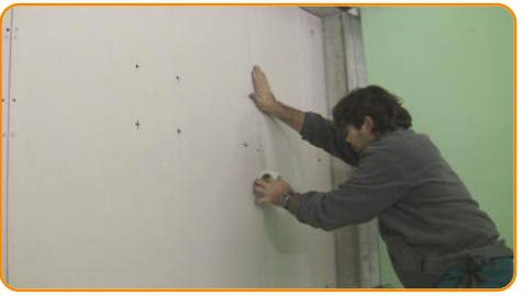
boards jointing lines