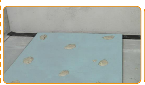
Lay the under wall strip