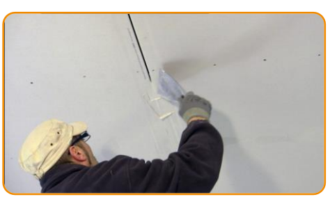
Fill the possible gaps between panels