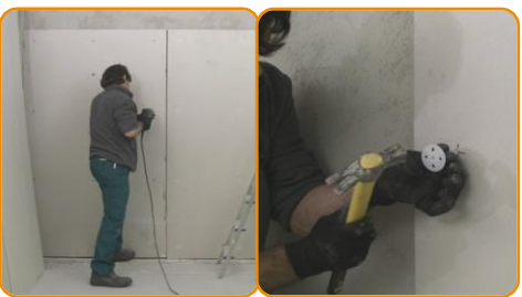
Proceed drilling the halls by a 10 mm driller and apply the nails