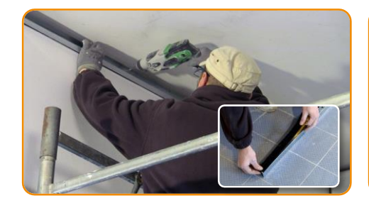
Glue the adhesive strip Stywall S3A to the metal studs and fix them along the upper perimeter of the room