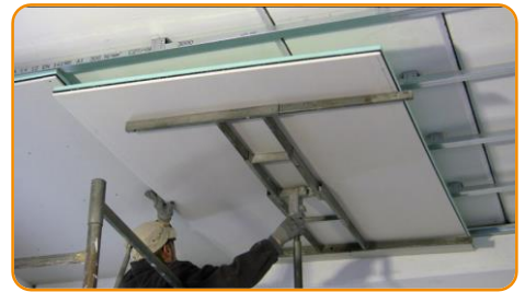
Lean the Rewall panel to the metal frame