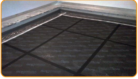
Seal the junctions between the panels with the Stik tape