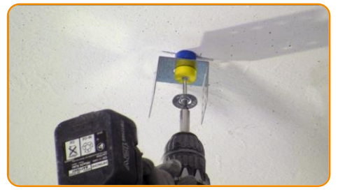
Drill the ceiling e fix the acoustic bracket