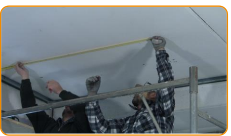
Calculate the distance of the metal studs of 50 cm and fix the acoustic bracket every 80