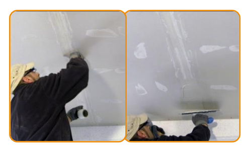
Apply the plastic mesh tape in the gypsum boards jointing lines and grouting