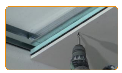
Fix the Rewall panel to the metal frame with 55 mm screws every 15 cm