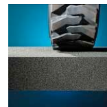
High compressive strength