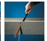
Easy cut to shape