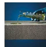
Acid resistant/chemical resistant