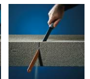
Easy cut to shape