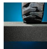
High compressive strength