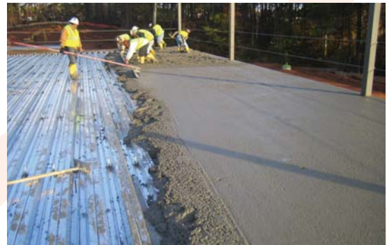
Composite Steel Deck