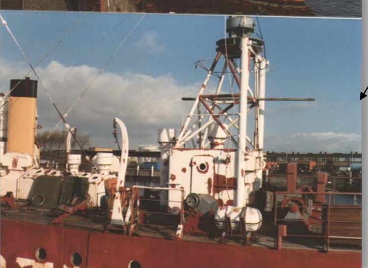
The same system was used under the water line, with an additional anti-fouling layer.

The lightship "Westhinder" has been treated with ZINGA in 1998. After sandblasting to a degree of Sa 2.5, ZINGA and topcoats were applied.