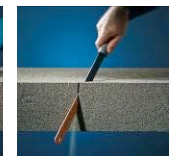
Easy cut to shape