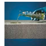
Acid resistant / chemical resistant