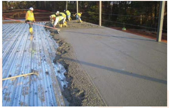
Composite Steel Deck