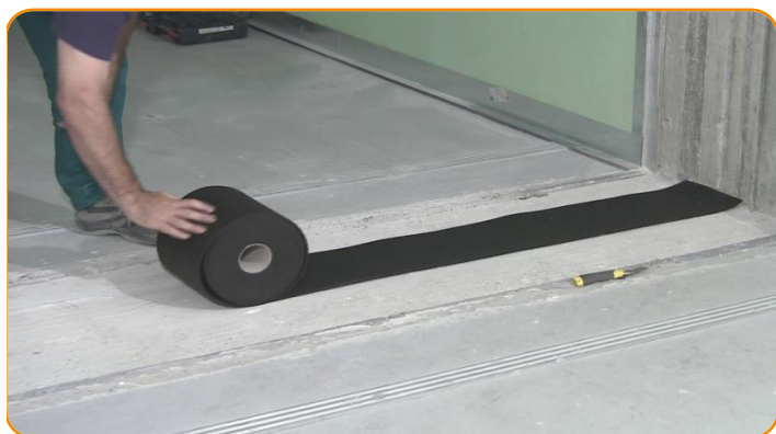
Lay the under wall strip