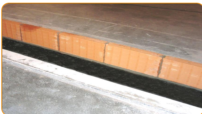
Over the Stywall lay down a plaster bed in order to start to built up the wall