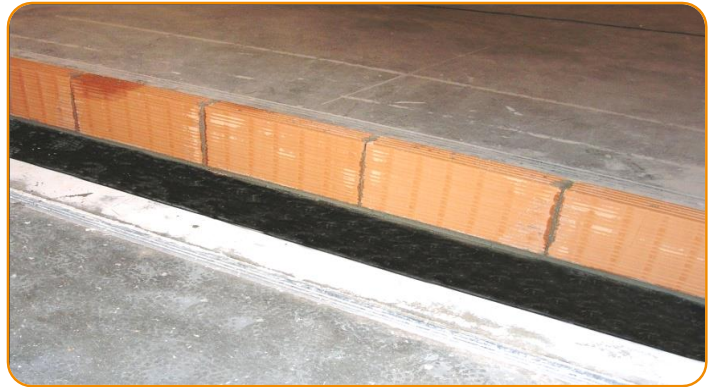
Over the Stywall, lay down a plaster bed in order to start to built up the wall