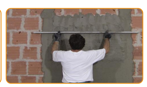
of about 1 cm thickness.