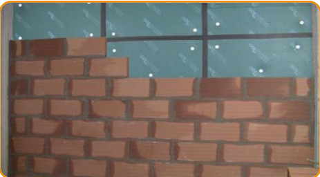
Build the second wall with the same process of the first one and insert the panel in the cavity