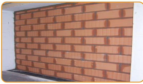
Build up the wall by caring to joint the blocks Apply in the first wall a layer of row mortar with mortar on both vertical and horizontal joints.