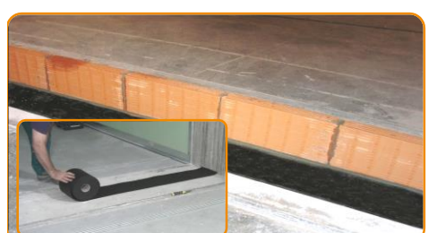
Lay the under wall strip in the dry floor. Build the wall.