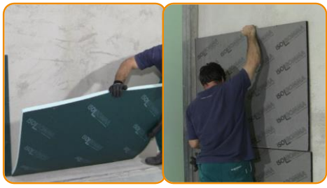
Apply the panel on the wall by forcing with homogeneous pressure.