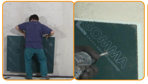
Place the panel on the right wall position and produce 5 holes per panel with the driller (one in the centre and one in the four corners)