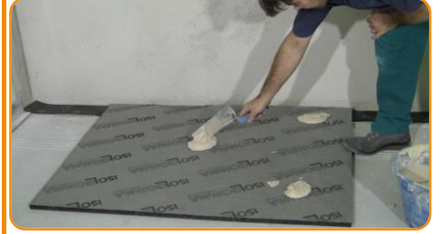
Apply the glue on the panel by spreading it on dots. (suggested glue Knauf Perlfix)